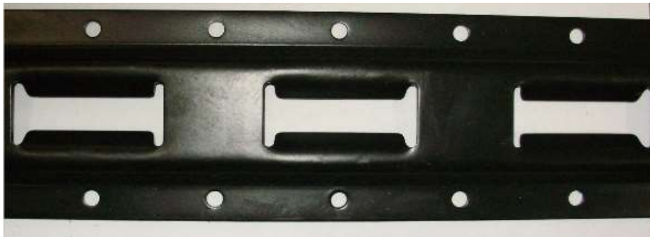
Vertical E track; painted (galvanized also available)