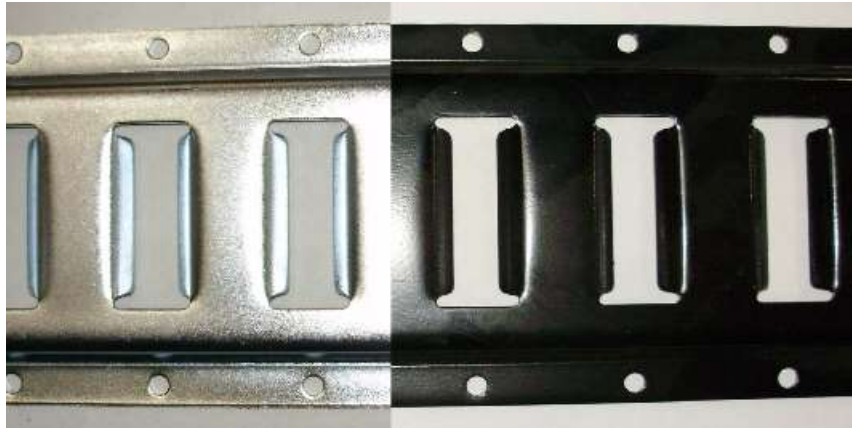
Horizontal E track; galvanized vs. painted